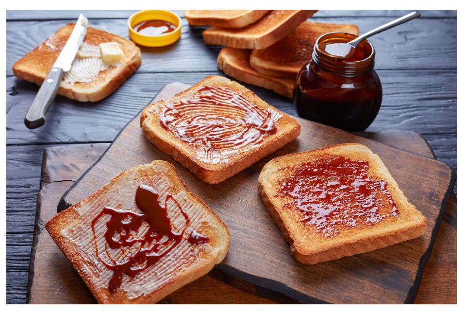
Marmite issue: shortages in yeast from breweries, coupled with rising demand, has led to empty shelves.

Q1 company earnings calls were dominated by both optimistic management outlooks on sales recovery, but also cautionary warnings around rising